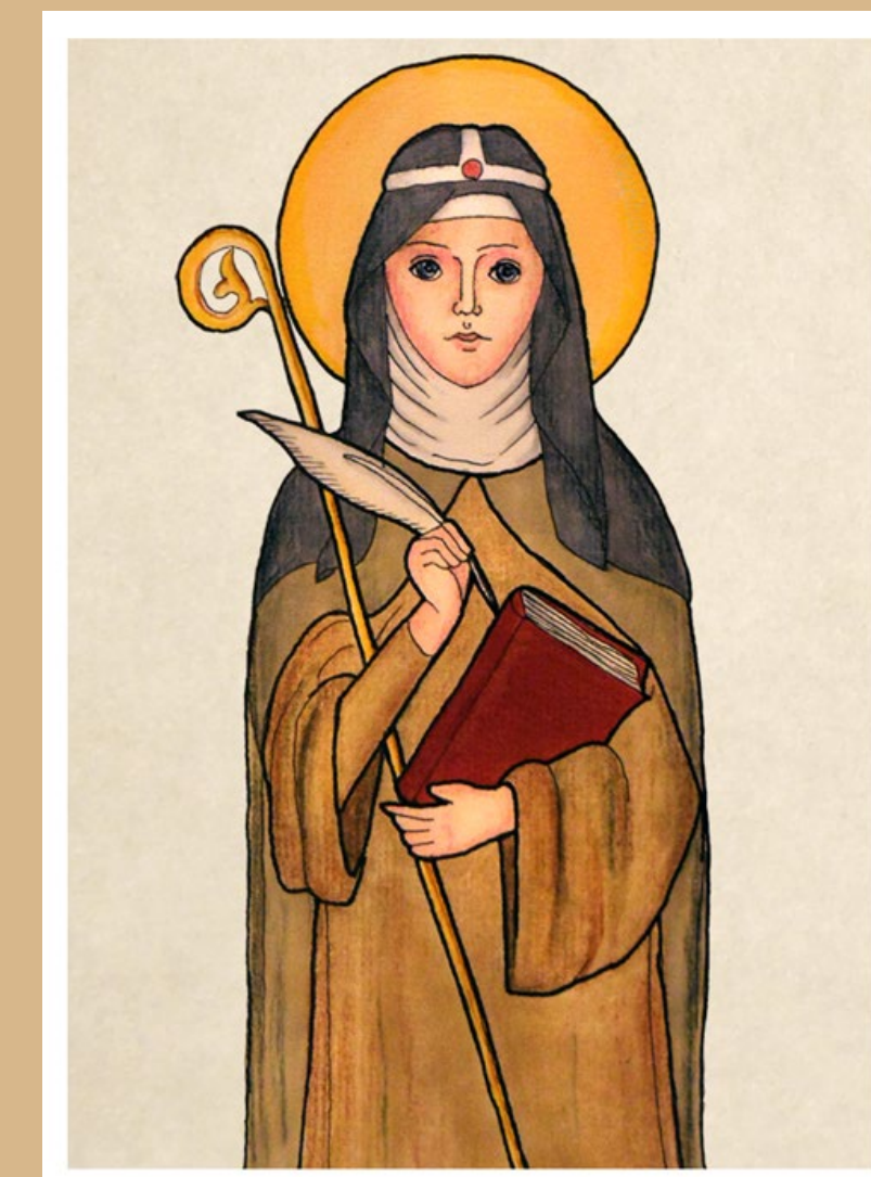
Birgitta of Sweden

Over the course of my time with McNair, much of my research has focused on female saints of the Middle Ages, as well as medieval religious literature written for and by women. This semester I decided that I wanted to explore the ways in which female mystics of twelfth through fifteenth centuries are interconnected. For example, Dorothea von Montau's hagiography and The Book of Margery Kempe reference Birgitta of Sweden. As such, Birgitta is the focal point of my project. In order to demonstrate this interconnectedness, I used ArcGIS, a digital mapping software, to create an interactive map of the lives of these women including Catherine of Siena, Elizabeth of Hungary, and Catherine of Vadstena. This map visually demonstrates trends that these women took part in such as chaste marriages, pilgrimages, and participation in ascetic practices. Additionally, this interactive map provides links to sites that have more information on the process of canonization, religious orders, and the Avignon Papacy.