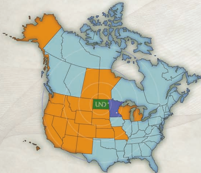
Estimated Undergraduate Costs ($US, based on 2008-2009 rates and are subject to change)

Estimated Undergraduate Costs - This is a general estimate of student expenses during a nine-month college year, based on 2008-09 costs. Our Cost Estimator, available at www.go.und.edu , can also help give you an idea of what you can expect to pay for a year at UND. All charges are subject to change.