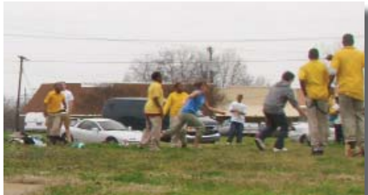
Pictured above: Honors students making friends while on the Pay It Forward Tour 2008.