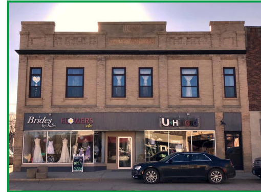
fully occupied with tenants, she has set her sights on her second project in 2022.

The advice Teena leaves to other entrepreneurs is that, "You must be persistent. Stay focused on your intended outcome and know you'll need to be flexible and will be frequently discouraged. Be fast to adjust as the environment and conditions change and be willing to accept help when you need it."